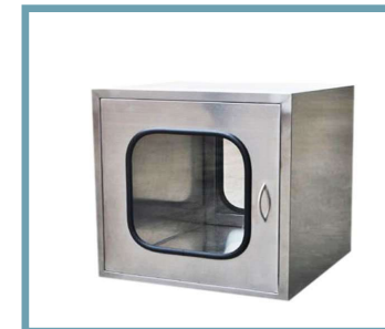
Static Pass Box