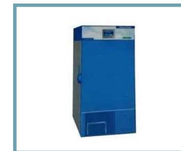
Deep/Ultra Low Freezer