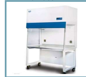
Laminar Air Flow