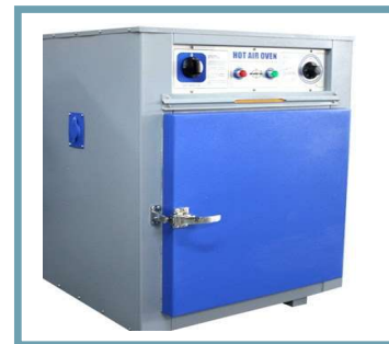
Hot Air Oven