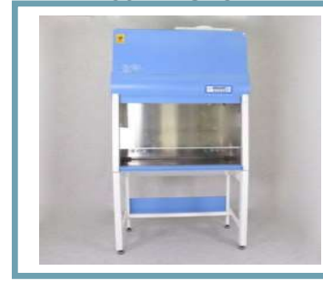
Bio Safety Cabinet