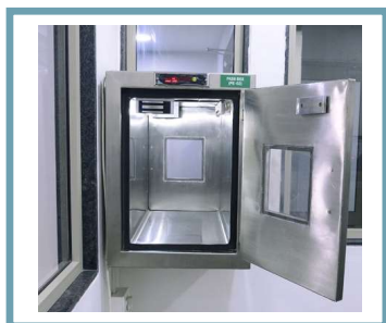
Dynamic Pass Box